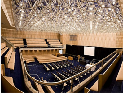
Grand Lodge Room Sydney Masonic Centre