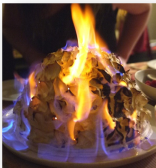
The Baked Alaska

The Festival of Baked Alaska is a giant Christmas Party for under-privileged children. The children arrive at about 2.15pm, and for the next two and a half-hours, all hell is let loose in the normally sedate and hallowed surroundings of Zetland Hall.