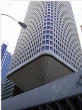
Sydney Masonic Centre Exterior View

I am pleased to say that Freemasonry in Australia looks to be doing well, and I have been very well received at Lodge meetings. Aprons are worn in a different way of course, but other than that, I have found great fellowship, and hospitality. As in Ireland, Masonic halls vary in size: Sydney Masonic Centre is a 25 story Skyscraper, with a very large Grand Lodge room.